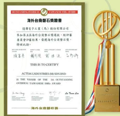
Outstanding Overseas Taiwan Small & Medium Enterprises Award