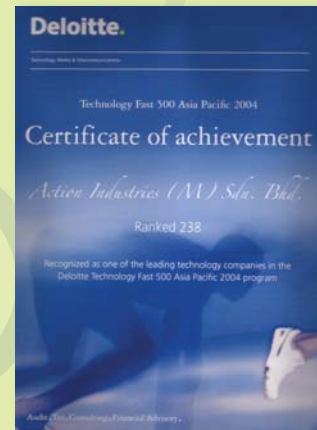
Certificate of Achievement