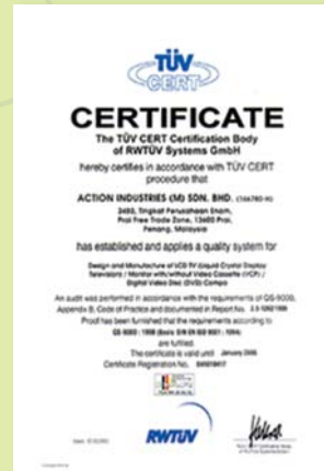
QS 9000: 1998 achieved in 1999 Certificate No. 04100417