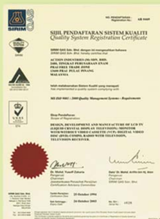
MS ISO 9001 : 2000 achieved in October, 1994 Certificate No: AR 0469